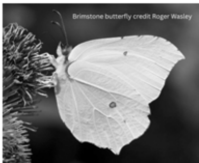
Brimstone butterfly

We'd love to know what butterflies you see as well as any other wildlife that you spot. Why not while away a sunny hour or two looking for butterflies in this beautiful place.