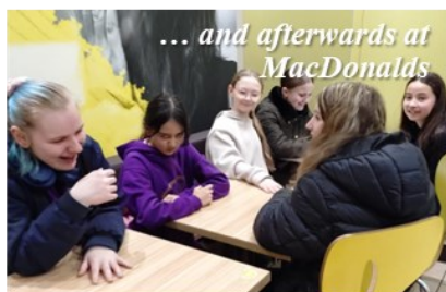
... and afterwards at MacDonalds