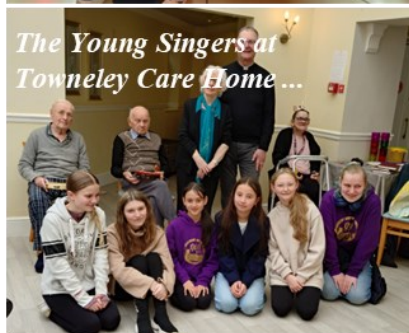
The Young Singers at Towneley Care Home ...