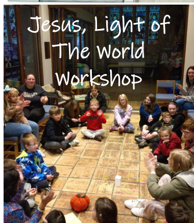
Jesus, Light of The World Workshop