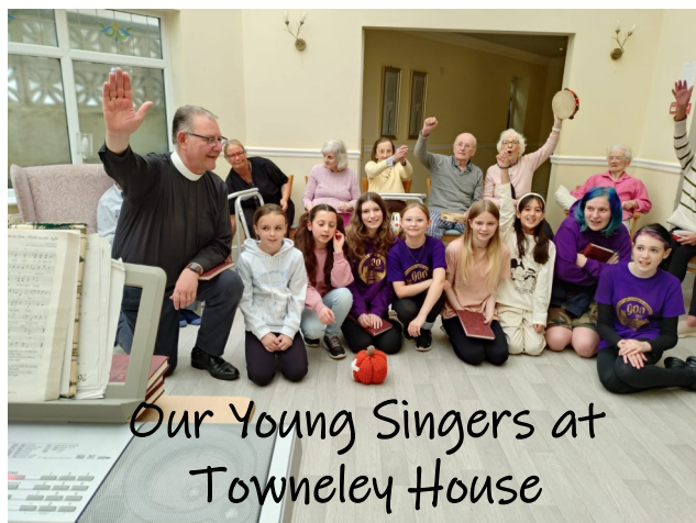
Our Young Singers at Towneley House