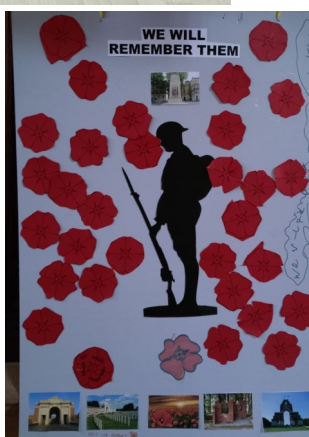
Last month at St Peter's